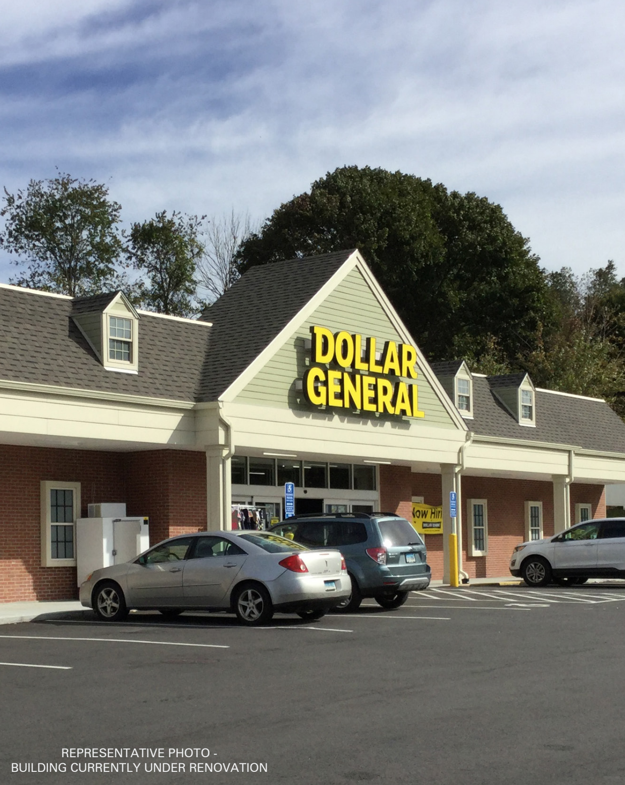
REPRESENTATIVE PHOTO - BUILDING CURRENTLY UNDER RENOVATION