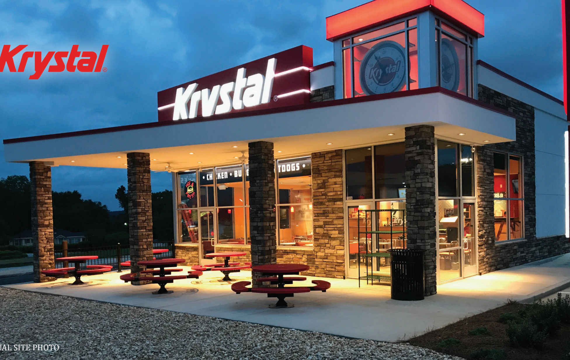
ACTUAL SITE PHOTO