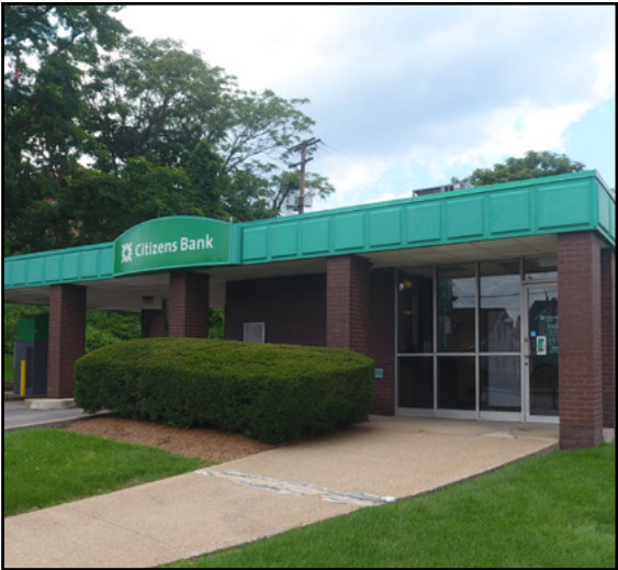
*Actual Location Photos