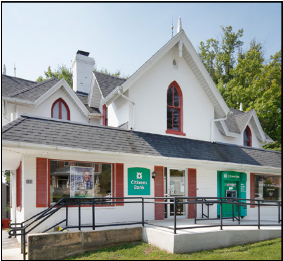
*Actual Location Photos