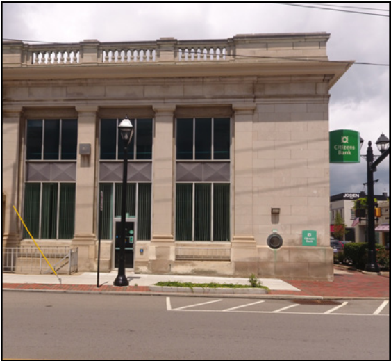
*Actual Location Photos