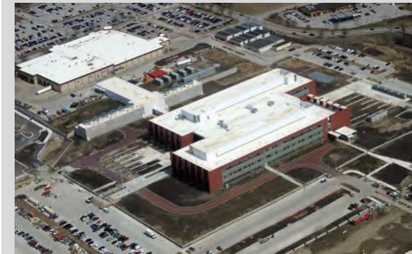
A March 2018 aerial photo of STRATCOM's new C2F shows the project's progress. From this new facility, the command will conduct strategic planning and warfighting operations; provide global situational awareness to the National Command Authorities and combatant commands; aid the president's nuclear response decision-making process; and, if called upon, deliver a decisive response in all domains.

Once work is complete in October 2018, the building will have redundant, secure fiber and copper information technology systems supporting more than 3,500 users. This will enhance the nation's strategic deterrence capabilities and provide a modern enterprise network that will assist with numerous other missions and tasks such as analysis and targeting as well as missile defense. STRATCOM also will be able to provide reliable retransmission capabilities to U.S. Air Force Global Strike Command and other strategic forces.