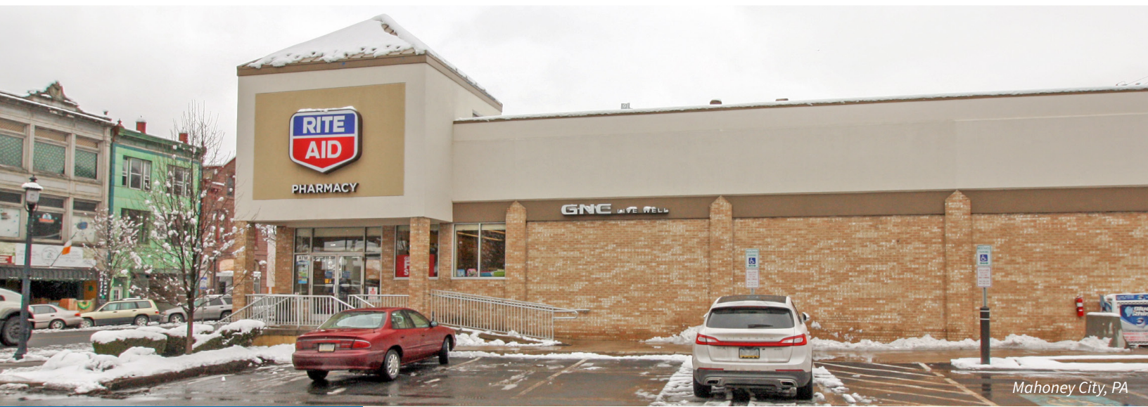
Mahoney City, PA